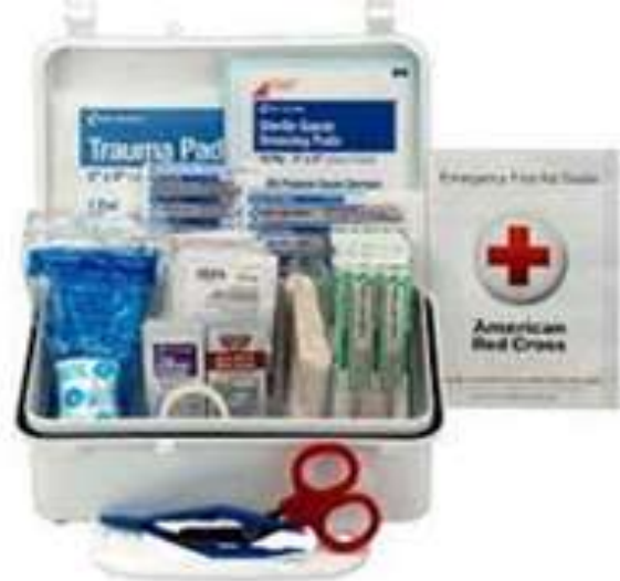
Fig. 2. First aid kit

In operating heavy equipment in the field, they have a valid operating license (SILO) and a competent operator (have SIO and have photos of workers attached to the equipment). The Service Provider provides and prepares first aid for accidents (P3K) and first aid kits, conducts monitoring related to the implementation of construction safety and evaluation of compliance and ensures that all equipment that requires accuracy in measurements is calibrated to ensure measurements are in accordance with applicable standards.